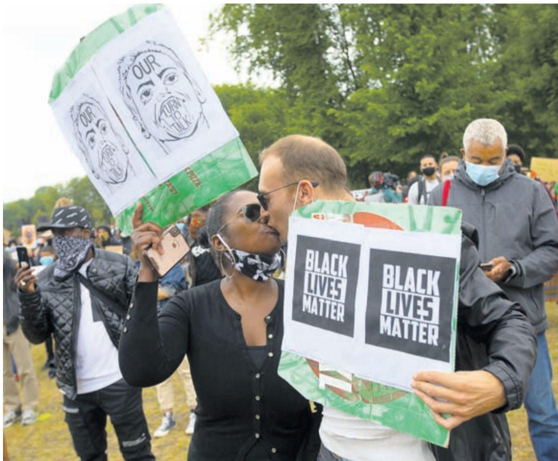
A couple kisses as they and thousands of other people demonstrate in support of the Black Lives Matter movement in a park in Amsterdam, Wednesday June 10, 2020, named for South African anti-Apartheid icon Nelson Mandela.

Public debate about racism, discrimination and historical links to the slave trade have intensified